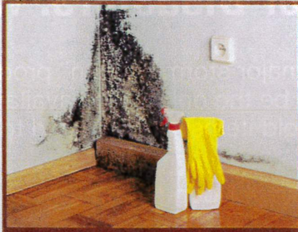
Moderate mold damage