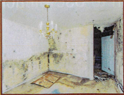
Home with major damage