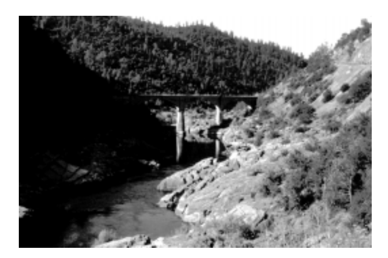
Overall management system performance at the Auburn Lake Trails Onsite Wastewater Disposal Zone is very high. Fewer than 1% of onsite systems have malfunctioned since management began. The few malfunctions, while creating an inconvenience for homeowners, have not resulted in public health problems or environmental contamination. No wastewater has been discharged from Auburn Lake Trails to the highly valued American River.

Management entities aggressively monitor routine maintenance and repairs to make sure they are done