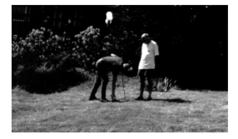
The inspector at Auburn Lake Trails has been checking the more than 850 mound and other onsite systems since 1993 as a full-time job. Because he knows so much about every system, inspections are completed quickly. When asked what he likes best about his work, he said he likes dealing with the public and working for a close-knit utility company.

Maintenance and repair costs vary. Some management entities set fees so they can provide the necessary maintenance for everyone. In others, the property owner contracts and pays for necessary maintenance and