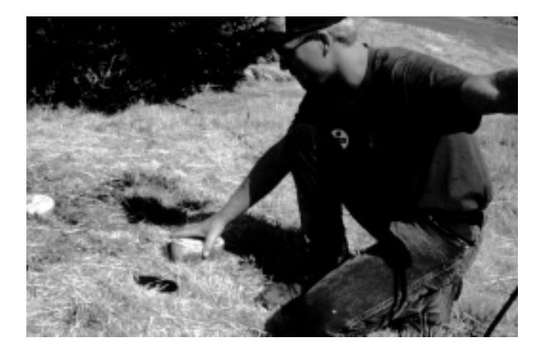
About 107 mound systems are inspected each year at Auburn Lake Trails. By catching problems early, they can be corrected by the management entity and reduce the environmental and public health impact. If a problem, such as ponding in the gravel bed, is identified the system is checked every three months to ensure that raw sewage does not come to the surface.