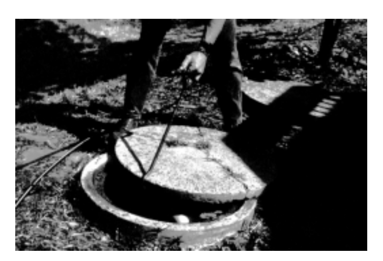
All mound systems at Auburn Lake Trails have tank risers, lateral valves and risers, inspection ports and groundwater monitoring wells. The management entity replaces trench monitoring risers and caps, flushes disposal bed lines, helps homeowners with advice on problem solving (odors, pump alarms, pumping) and performs legally required environmental monitoring.

Because mound systems have mechanical dosing systems, each mound system should be inspected every 6 months. Inspections take from 30 to 60 minutes to complete and include: